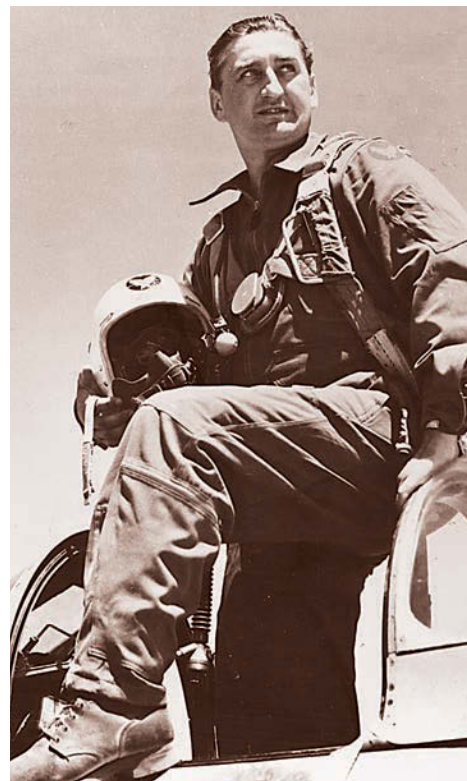
Francis Gabreski (6.5)