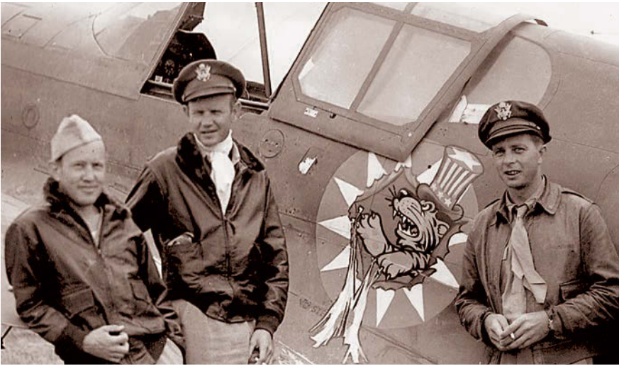
John Alison (6), David Hill (6), and Albert Baumler (5)