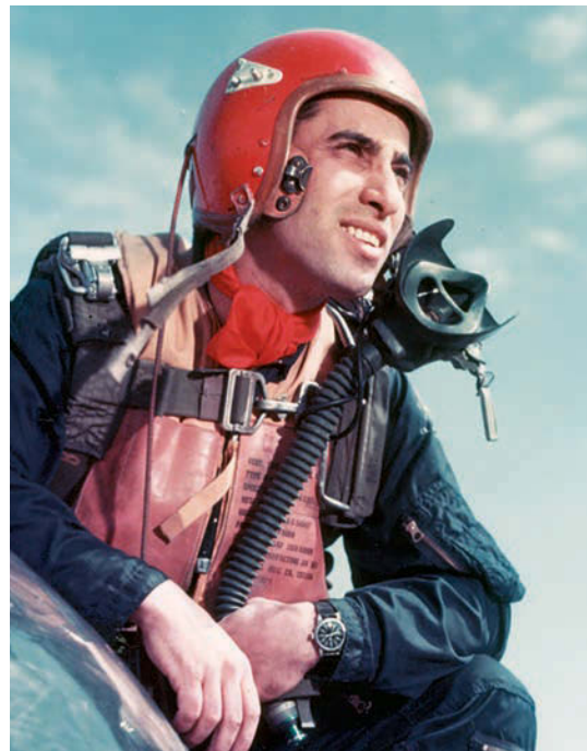
James Jabara, the first USAF ace of the Korean War. Jabara scored 15 victories before the end of the war.