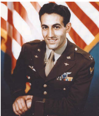
Don Gentile (19.83)

Ranks are as of last victory in World War II.