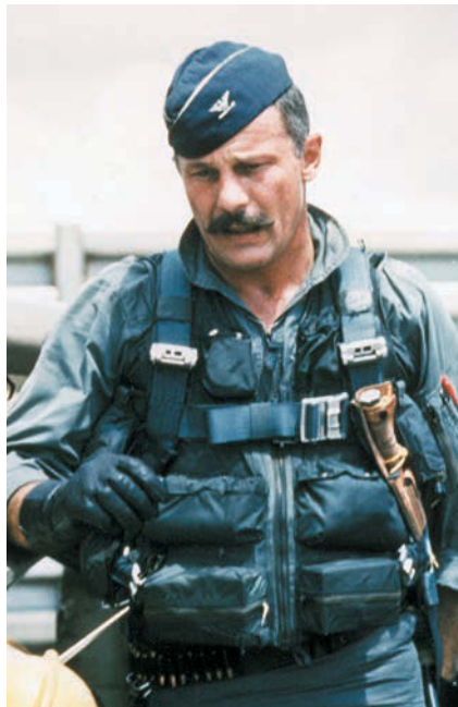
Left: Robin Olds is the only USAF ace with aerial victories in both World War II and the Vietnam War.