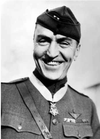
Eddie Rickenbacker (26)